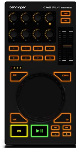
CMD PL-1 Platter Control Module

And remember that at its heart, the LC-1 is an array of assignable buttons and knobs. So, why not use it to access cue points in Virtual DJ or Traktor? Or with a step sequencer? The LC-1 can handle all this and more with ease.