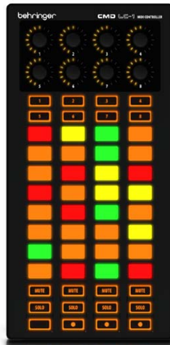
CMD LC-1 Live Control Module

Ableton Live is amazing and powerful software, adding new DJ converts on a daily basis. While the benefits of Live for DJ use are clear, compelling hardware control can be a challenge. As a DJ, do you move away from the workflow you've been using for years and feel comfortable with? Or do you map Live to a traditional controller, but miss out on the number of buttons needed to trigger clips effectively? The CMD LC-1 provides the best of both worlds.